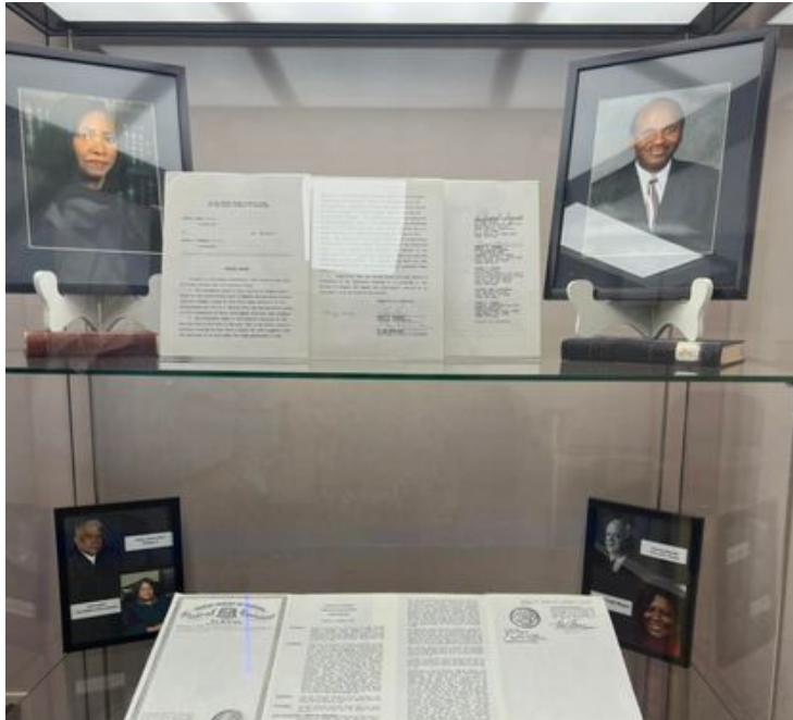
Clark v. Edwards case display

This year's conference concluded with the Clark v. Edwards display unveiling ceremony. The display is housed in Law Center's Oliver B. Spellman Law Library.